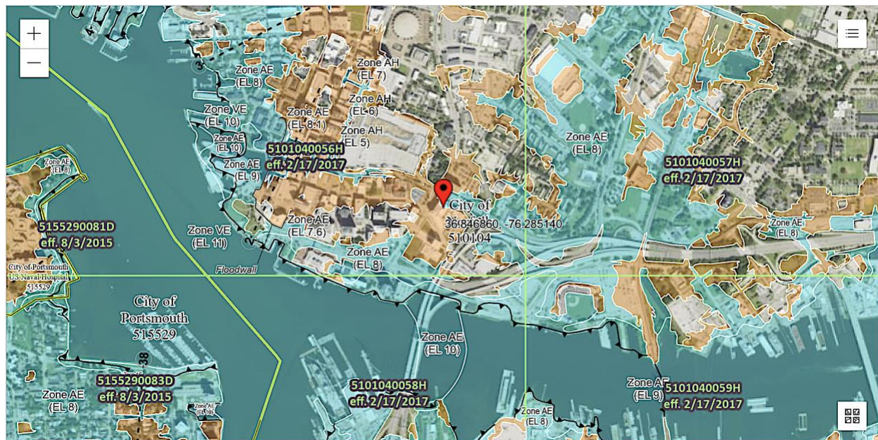
Figure 1: Some of the areas in Hampton Roads, VA with a 1-percent annual chance flood (i.e. 100-year flood zone). These areas are designated in teal as Zone AE and in tan as Zone AH.

Flooding is the most common natural disaster in the U.S. It can cause power outages, disrupt transportation, damage buildings, and create landslides (FEMA, 2024). The Elizabeth River in Hampton Roads, VA poses flood threats to certain communities and businesses. Figure 1 shows that where the threats are greatest for communities and businesses. This occurs in areas identified as 100-year flood zones. An area with a 1-percent annual chance flood is also referred to as the base flood or 100-year flood. In the figure these areas are designated in teal as Zone AE and in tan as Zone AH (Mitchell, 2021; Hunt et al., 2019; Skaggs & Seltzer, 2002). Given this threat we construct risk communications for flooding on the Elizabeth River in our study to reflect the domain of natural hazards.